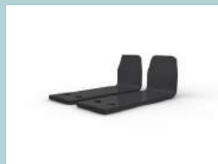
Linking parts (2 pcs.)