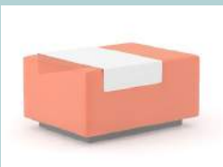
Metal table placed on the pouf (black or white colour)