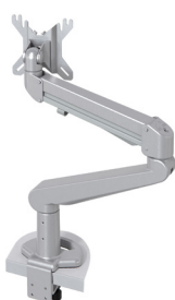
438-LC53 MONITOR ARM LC53, SILVER