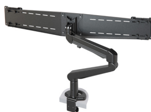
438-LC58B MONITOR ARM LC58 DUO-BAR, BLACK