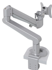
438-LC60 MONITOR ARM LC60 HEAVY, SILVER