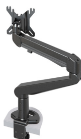
438-LC53B MONITOR ARM LC53, BLACK