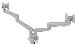
438-LC52 MONITOR ARM LC52 TWIN-ARM, SILVER