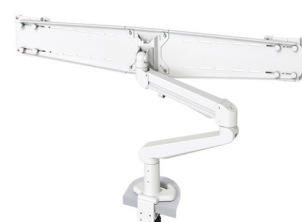
438-LC58W MONITOR ARM LC58 DUO-BAR, WHITE