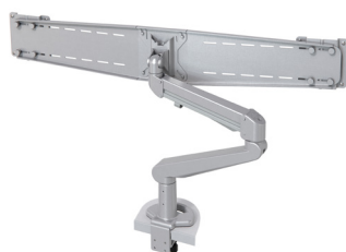
438-LC58 MONITOR ARM LC58 DUO-BAR, SILVER