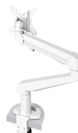
438-LC53W MONITOR ARM LC53, WHITE