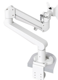
438-LC60W MONITOR ARM LC60 HEAVY, WHITE