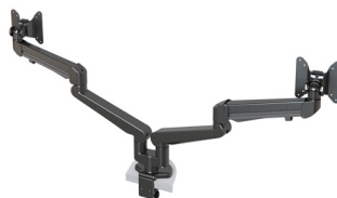
438-LC52B MONITOR ARM LC52 TWIN-ARM, BLACK