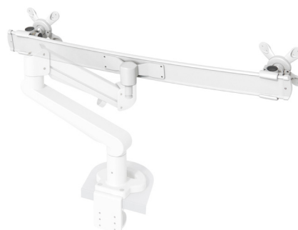
438-LC61W MONITOR ARM LC60 HEAVY DUO-BAR, WHITE