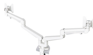
438-LC52W MONITOR ARM LC52 TWIN-ARM, WHITE