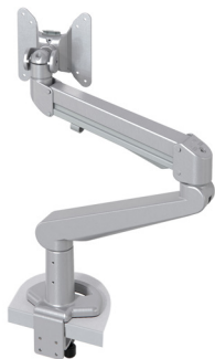
438-LC50 MONITOR ARM LC50, SILVER