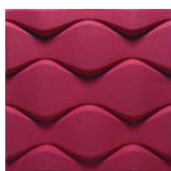
SOUNDWAVE® FLO Acoustic Panel By Karim Rashid