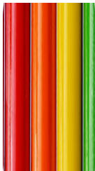
RAL on request