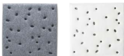
SOUNDWAVE® LUNA Acoustic Panel By Teppo Asikainen