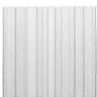
SOUNDWAVE® SKY Acoustic Panel By Marre Moerel