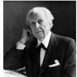
FRANK LLOYD WRIGHT