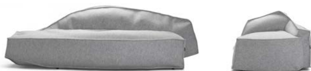
AIRBERG Sofa & Easy Chair By Jean-Marie Massaud